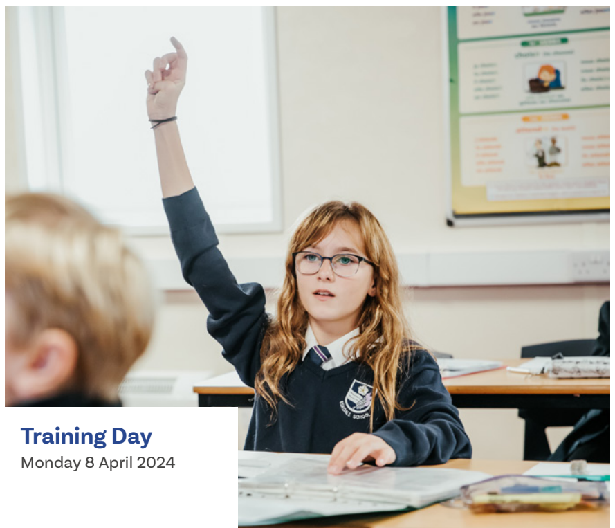
Training Day Monday 8 April 2024