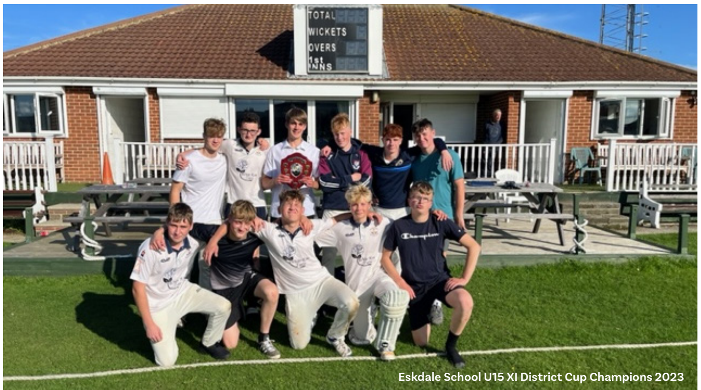
Eskdale School U15 XI District Cup Champions 2023